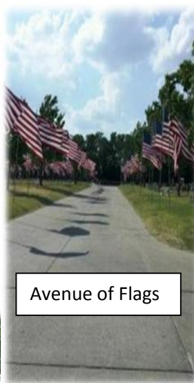
Avenue of Flags