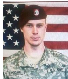
SGT Bowe Bergdahl

Perhaps it was fate that I met them both on Memorial Day weekend.